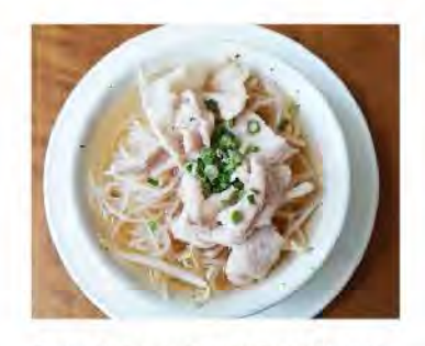
THAI NOODLE SOUP

SOMETHING MORE? SMALL PELLEGRINO 150 LARGE PELLEGRINO 250 GLASS OF PROSECCO 400 MIMOSA 450 BOTTLE OF PROSECCO 1,700 BOTTLE OF CHAMPAGNE 3,900