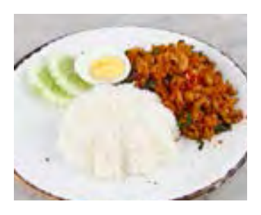
FREE RANGE CHICKEN KA-PRAO Stir-fried chicken with hot basil

Stir-fried chicken with hot basil and chili, served with steamed rice