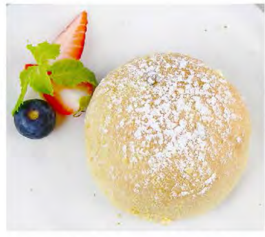
HOKKAIDO MILK BUN with vanilla cream

"EAT SOME BREAKFAST THEN CHANGE THE WORLD"