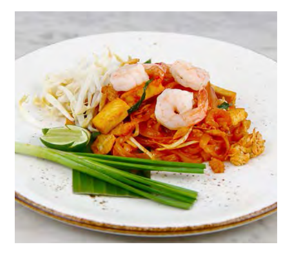
PHAD THAI stir fried noodles, peanuts, beans sprout and tamarindsauce