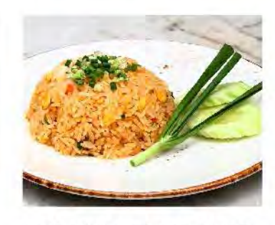
CHICKEN FRIED RICE That fried rice with chicken

Prawns wontons, bok choy and barbecued pork served in clear soup