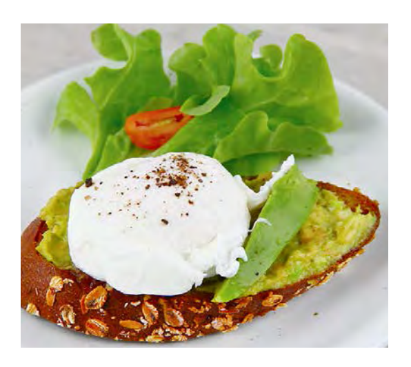
AVOCADO SMASHED on cereals bread toasted, poached egg

"EAT SOME BREAKFAST THEN CHANGE THE WORLD"