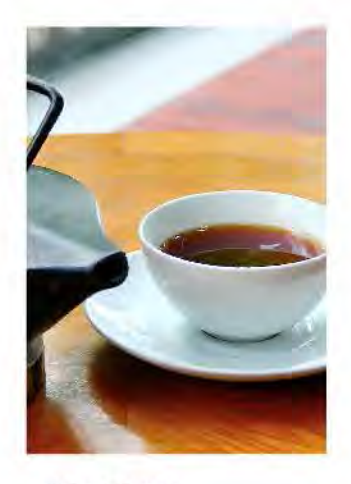
CHAIDIM ORGANIC ENGLISH BREAKFAST TEA