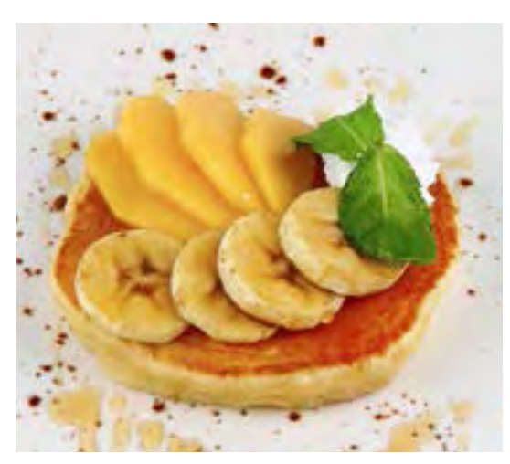
PANCAKE with banana, mango, whipped cream and organic honey