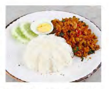
FREE RANGE CHICKEN KA-PRAO

Stir-fried chicken with hot basil and chili, served with steamed rice