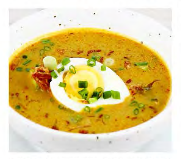
CHICKEN YELLOW CURRY with noodle, boiled egg on top

"EAT SOME BREAKFAST THEN CHANGE THE WORLD"