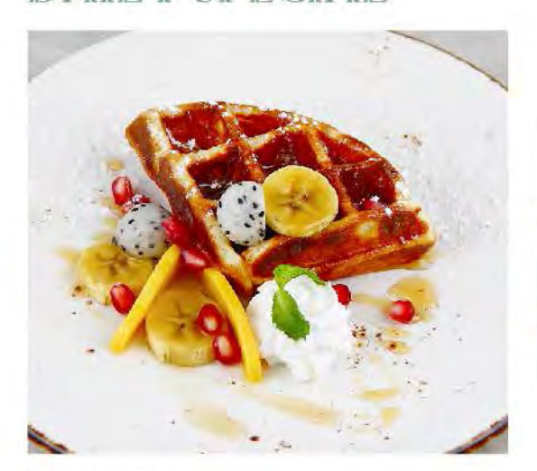
WAFFLE whole wheat, mix fruit, whipping cream