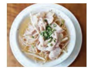
THAI NOODLE SOUP Rice noodle soup served with your choice of pork, chicken