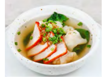
WONTON SOUP Prawns wontons, bok choy and barbecued pork served in clear soup