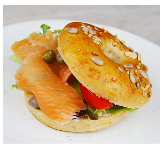
SALMON BAGEL Smoked salman bagel with cream cheese