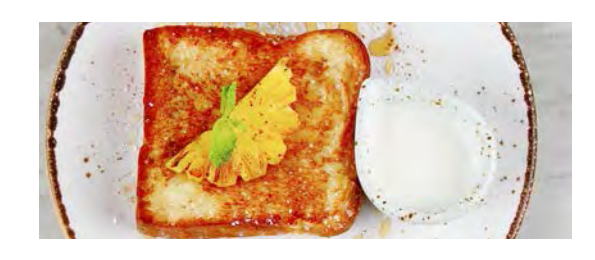
PAIN PERDU Freshly baked brioche bread with caramelized pineapple and coconut sauce