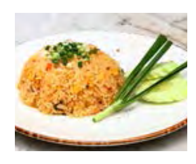
CHICKEN FRIED RICE That fried rice with chicken